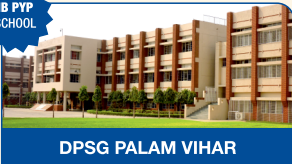
DPSG PALAM VIHAR

www.dpsgs.org/palam-vihar | 8595 020 202