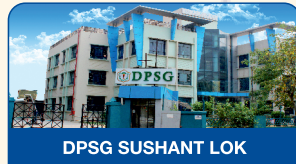
DPSG SUSHANT LOK

www.dpsgs.org/palam-vihar | 8595 020 202