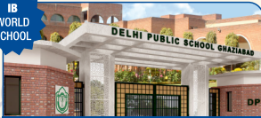
DPSG MEERUT ROAD